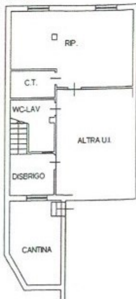
PIANO PRIMO SOTTOSTRADA H: 2.50 m